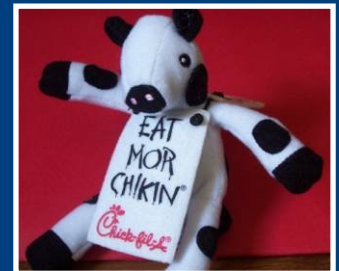
One local company, Chick-fil-A, that visited AMH this summer and is now delivering food for our evening meal.