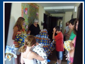
One CCD class from Londonderry that made cuddle blankets for our kids and one student who even conducted her own car wash & gave AMH the proceeds.